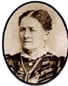
Dr Lucy Hobbs Taylor Lawrence, Kansas 1898

SENIOR ANSWERS AND SERVICES 3006 EAST COLFAX AVENUE DENVER COLORADO 80206